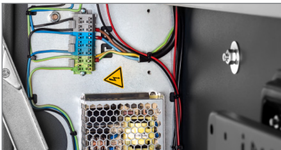
Cabling according to VDE guidelines